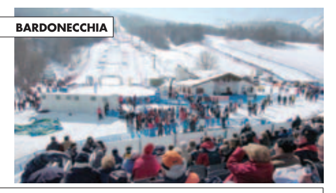
• Venue: Snowboard • Location: 95 km from Olympic Village Turin • Altitude: 1365 – 1595 m • Average snow depth in February: 76 cm • Average temperature in February – max/min: 9,2°C/-3,7°C • Gross capacity: 7.646