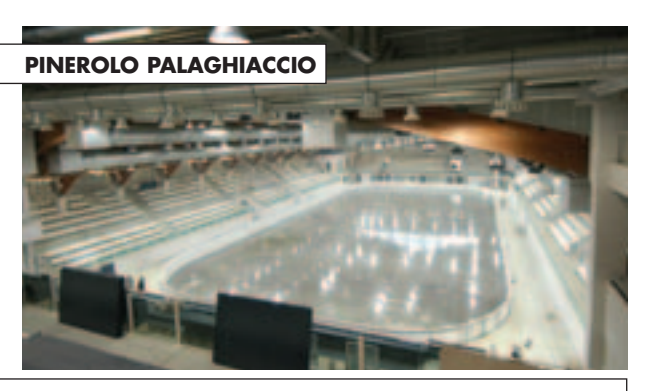
Venue: Curling • Location: 36 from Olympic Village Turin Gross capacity: 2.982